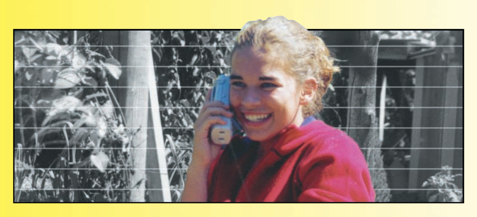
One of your VTel neighbors. Real People, Real Value

VTel's prices are the best in Vermont. If you can find a better price, tell us and we'll beat it!